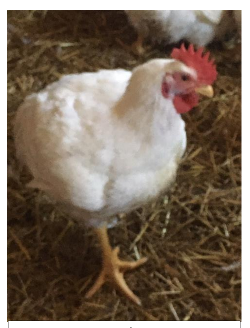
some are roosters that crow, COCK-A-DOODLE-DOO!