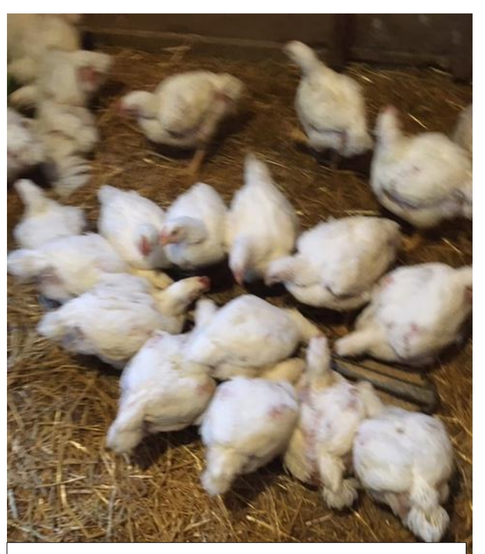
The chicks are growing bigger and bigger! They are 4 weeks old.